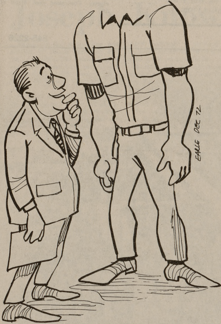
"Did I say we'd have a major quiz during dead week? Maybe you misunderstood!"