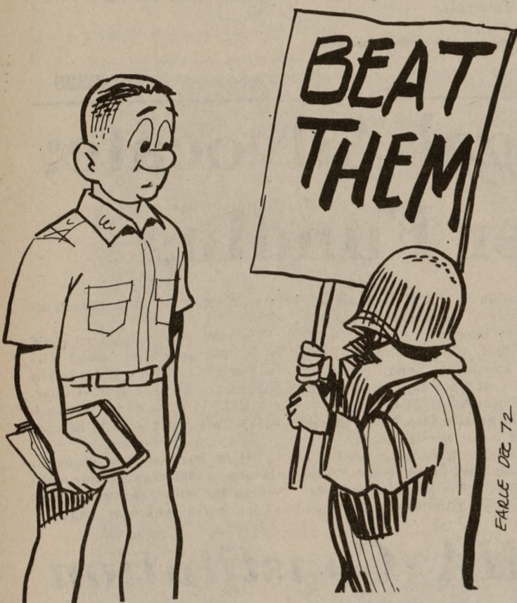
"You mean th' season is over?"