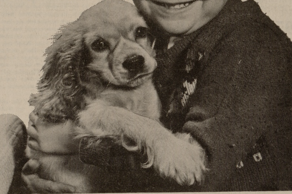
Copyright 1972 Keister Advertising Service, Inc., Strasburg, Virginia. Scriptures selected by the American Bible Society

High moments can't be assessed by material standards. But each inspiring revelation of God's love brings us closer to understanding Him and the Truth of His whole creation. That's why it is important to go to church.