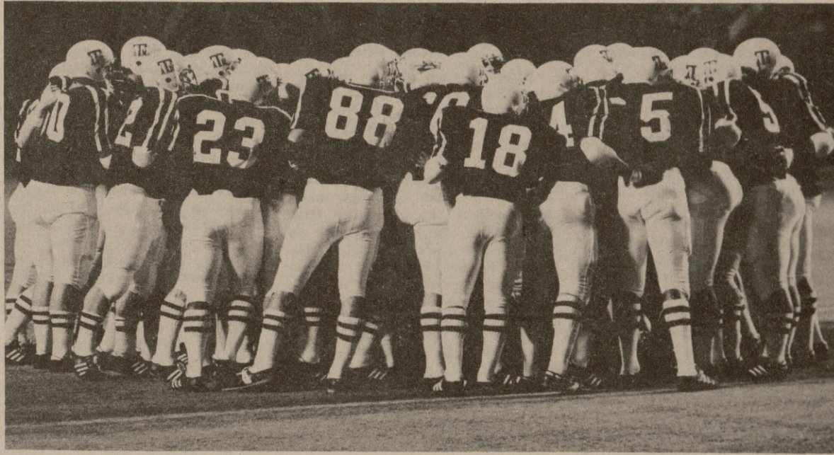
HERE ARE THE NEW AGGIES. Here, for the first time this season, is how the Aggies played Saturday night against Texas Tech. One cohesive unit with no individuals; just a football team caring for each other. Although the Aggies lost, they may have learned an invaluable lesson for the remainder of the season.