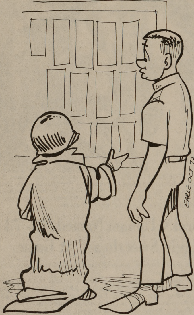
"Up until now he's been saying that learning is the most important thing and now, all of a sudden, grades are the most important."