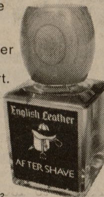
MEM Co., Inc., © 1972

If you're sharing your pad with a groovy gal who gives you English Leather, you're well on your way to a liberal education. Maybe she's trying to educate you that English Leather's fresh, clean, honest smell gets to her. And cheap perfume stuff turns her off. On the other hand, if you're not so lucky, maybe a little English Leather would help. It couldn't hurt.