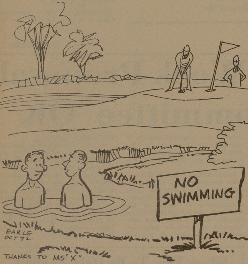
"Just because it's against th' rules is not enough for me! I'm cold and I'm getting out!"