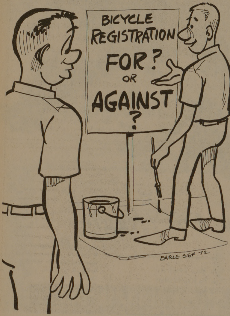
"I'm enjoying the debate so much, I may even get a bicycle!"