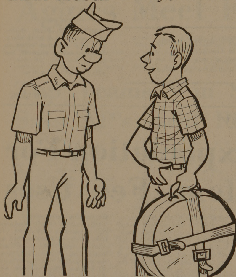
"It's what I call a break-away kit for those who had rather disassemble their bikes instead of registering them. I've got one problem to work out—It takes two hours to put it together again!"