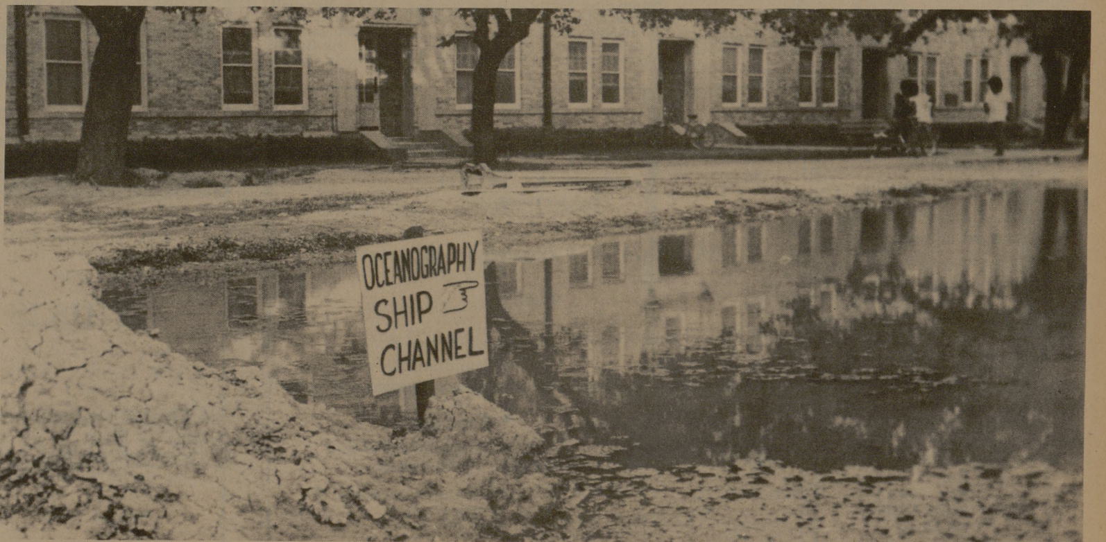
DEFINITELY NOT a place where one would find exotic fish, Hart Hall's "front yard" provided an interesting shoreline for the dorm Thursday after worker's unintentionally made the watery lake.