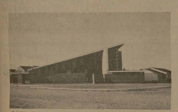
OUR SAVIOUR'S LUTHERAN CHURCH Tauber and Cross Sts.