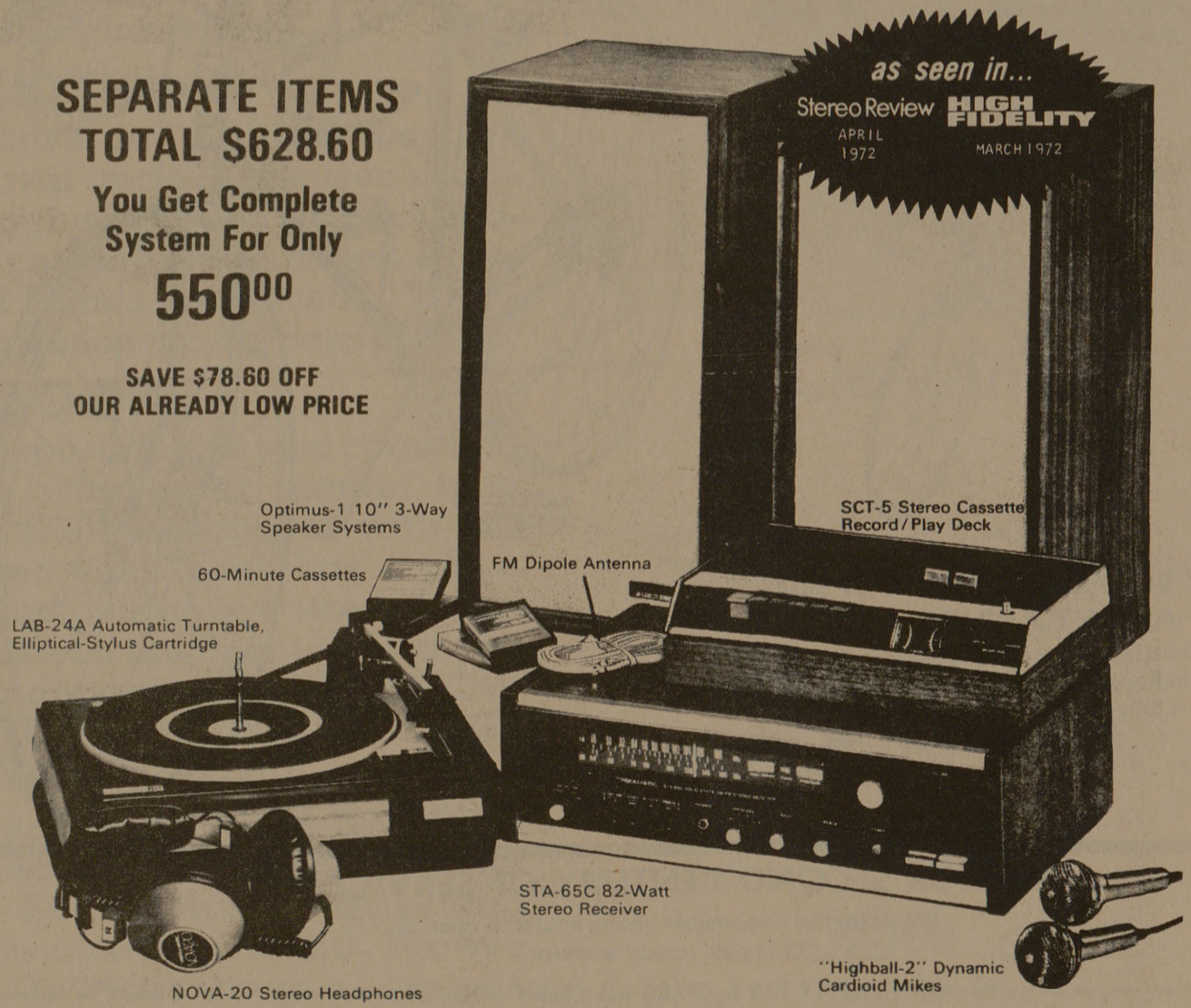
Optimus-1 10" 3-Way Speaker Systems