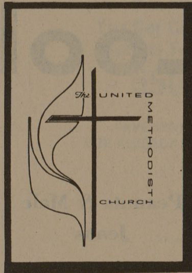
THE CROSS AND FLAME METHODIST SYMBOL