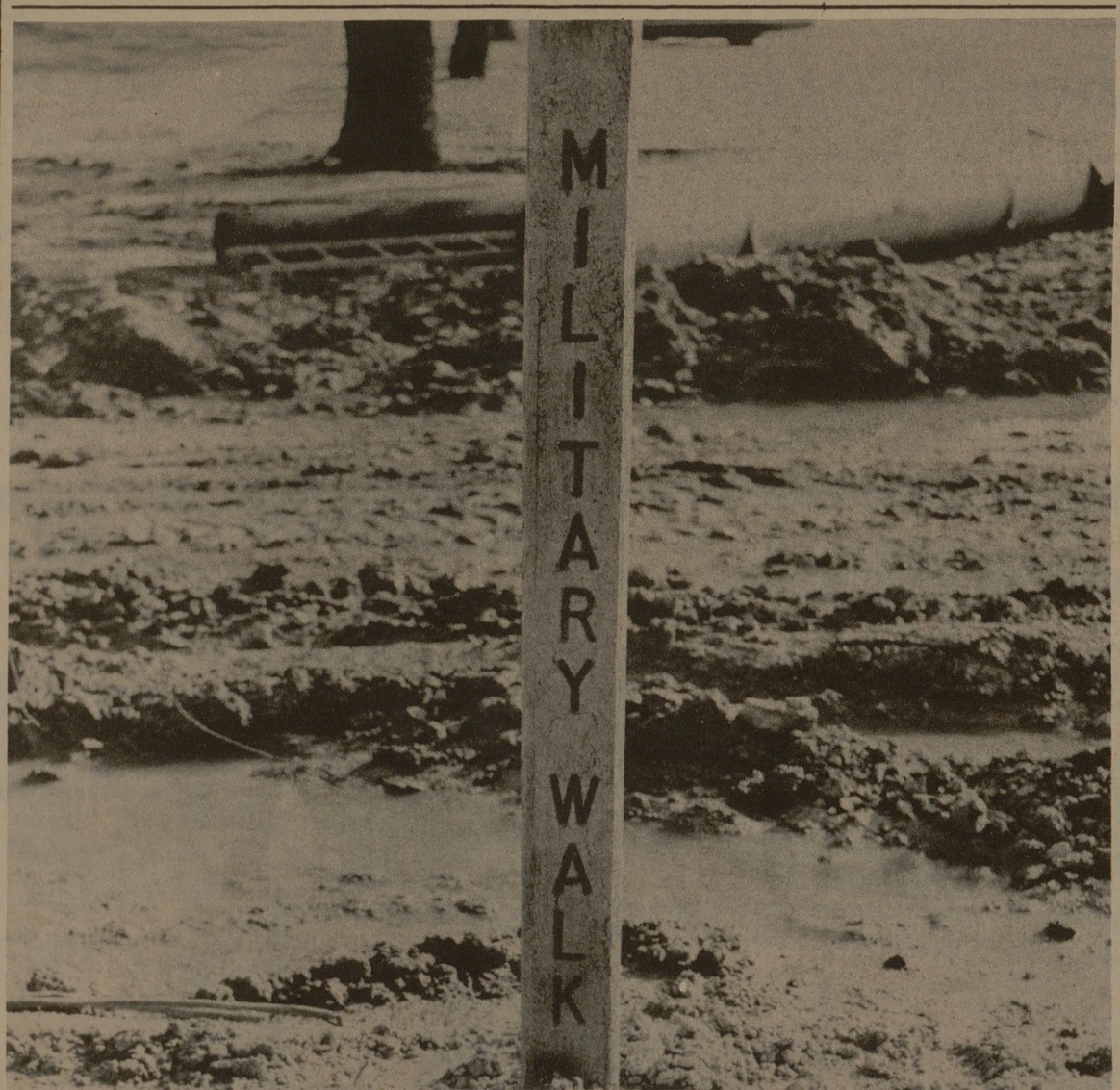
A SIGN OF THE TIMES at A&M is the Military Walk street sign in a bed of mud. The summer at Aggie land has featured a common sight, construction, and an unusual amount of rain, something not ordinarily in abundance from June through August.