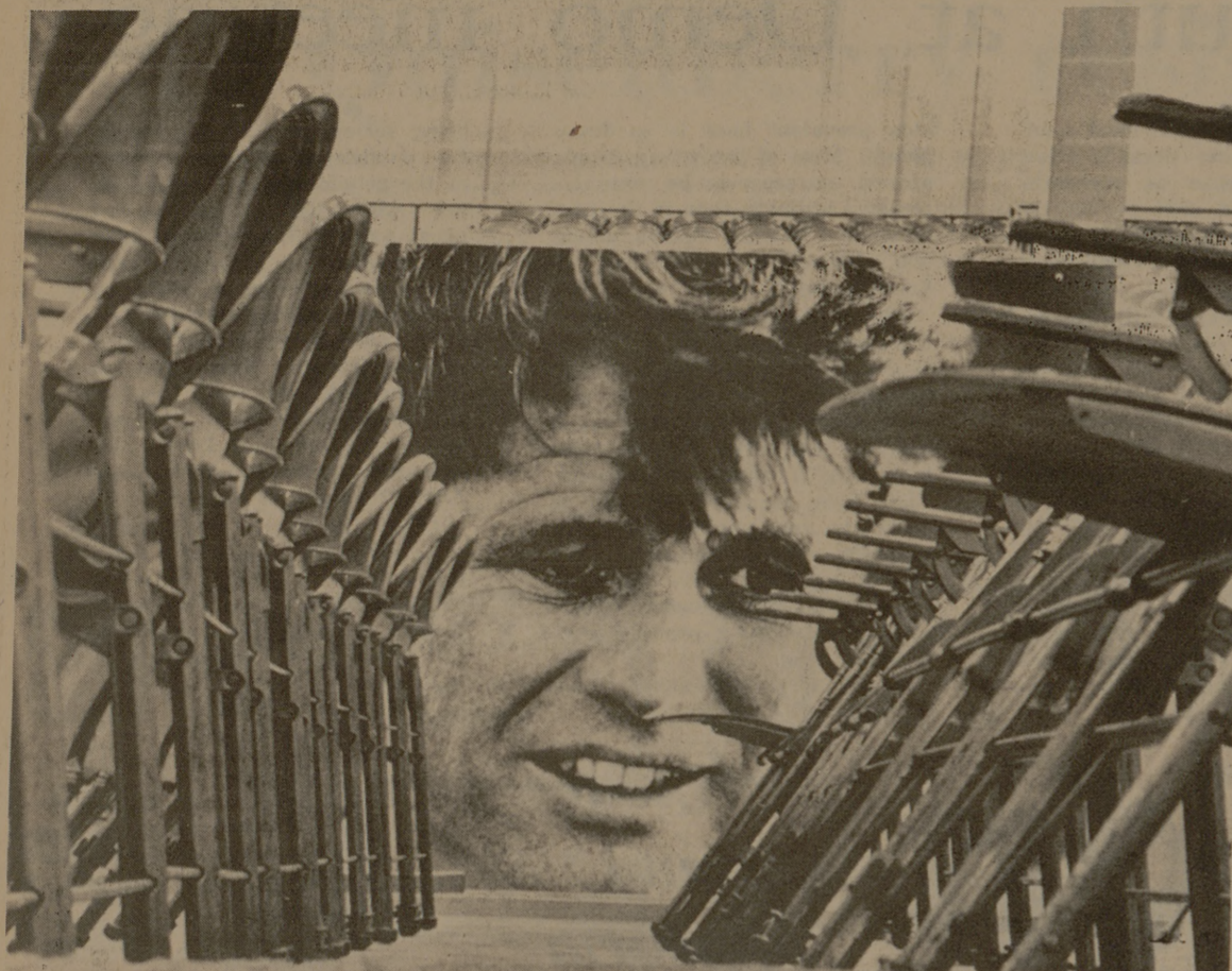
A PICTURE OF THE WAY THINGS MIGHT HAVE BEEN hangs in the Democratic National Convention Hall in Miami. A convention is a place of many fallen and forgotten hopes, and not the least of which is the late Robert F. Kennedy, assassinated presidential candidate of 1968. Sen. Ted Kennedy, RFK's younger brother, is being mentioned as a Vice-Presidential hopeful.