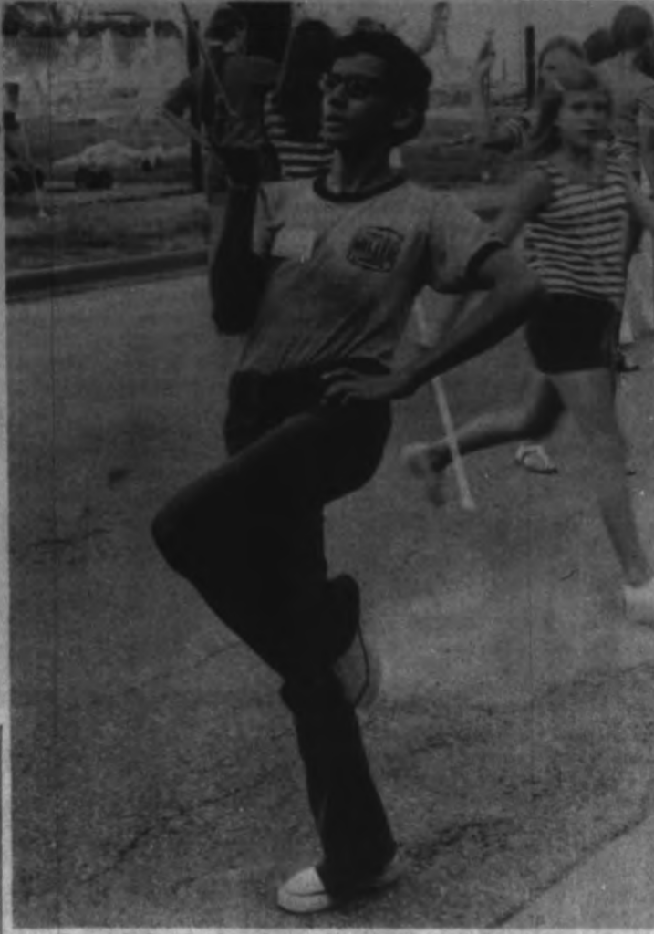
One of the high school cheerleader and twirler camp's six male participants practices outside Hughes Hall Tuesday. The campers come from six states. Classes continue until Friday morning.