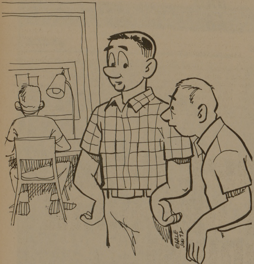
"He says he's going to study all night for the final exam tonight so he won't have to study all night at the end of the semester!"