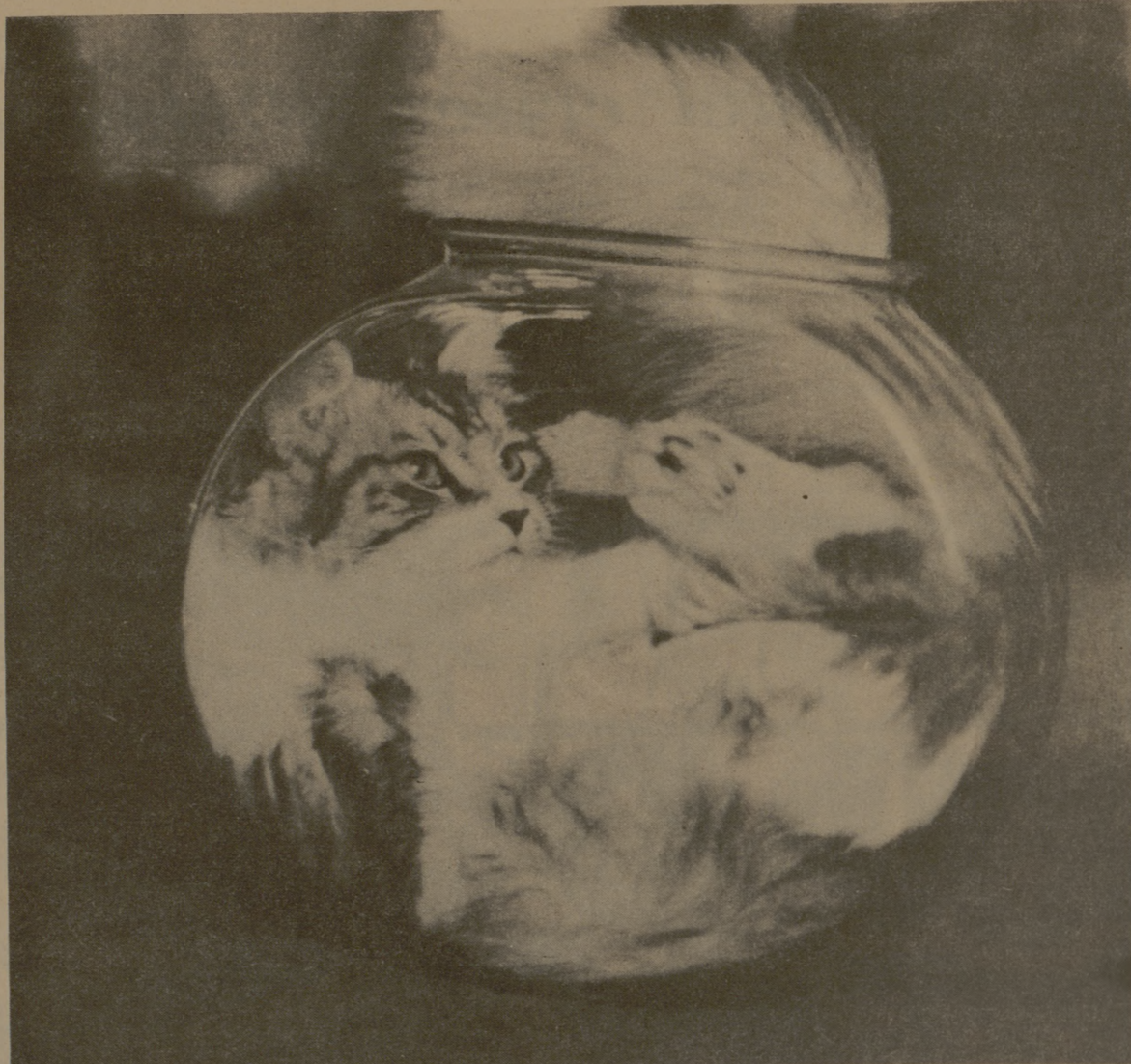
MANFRUM MARRS ISN'T A CATFISH; apparently he just decided an empty fish bowl was a good place to curl up for a catnap. Getting into the bowl was no problem, but Manfrum did have some difficulty getting out.