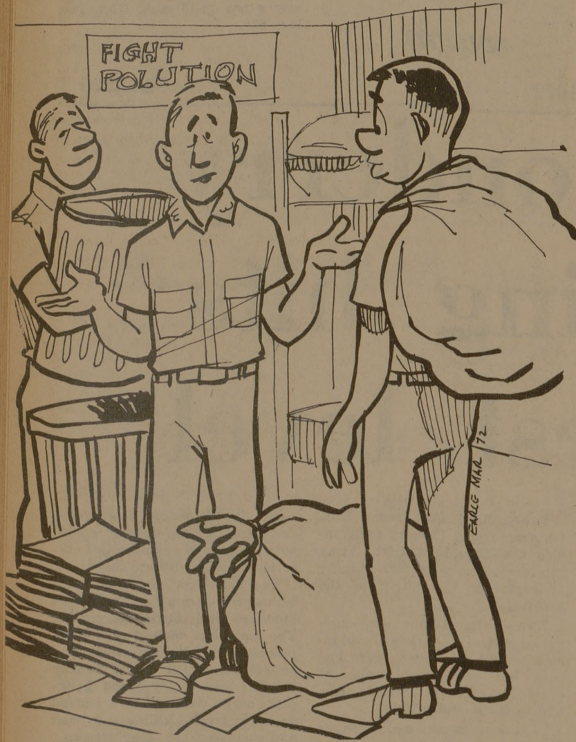
"Of course I've campaigned against pollution and littering, but I didn't mean that it should be put in my room instead!"