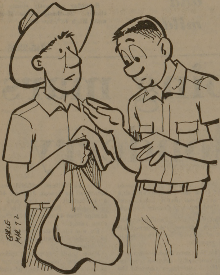
"We're trying to patch things up with the guys who complained about our rattlesnake hunt by giving each of them one!"