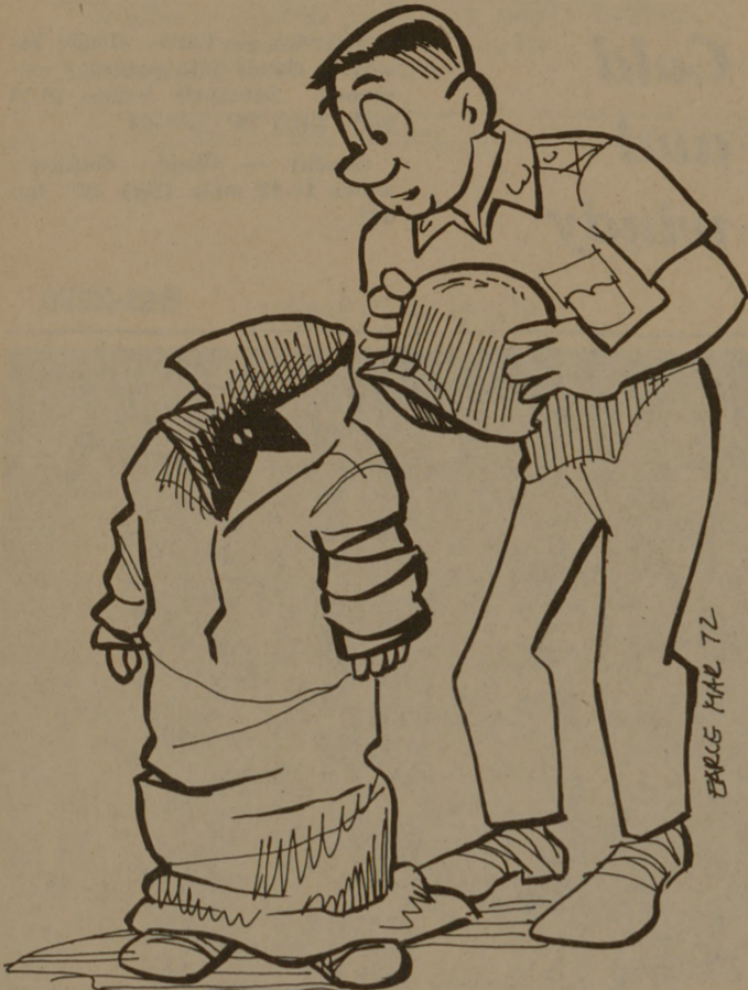
"No offense, Squirt, I just wanted to be sure that you weren't Howard Hughes!"