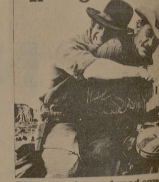
They were damned good cowboys until they robbed a bank.

William Holden Ryan O'Neal Karl Malden in a Blake Edwards Film WILD ROVERS