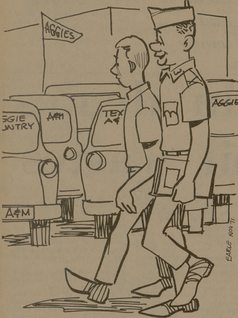
"Am I wrong, or aren't there more decals out now than before the Arkansas game?"