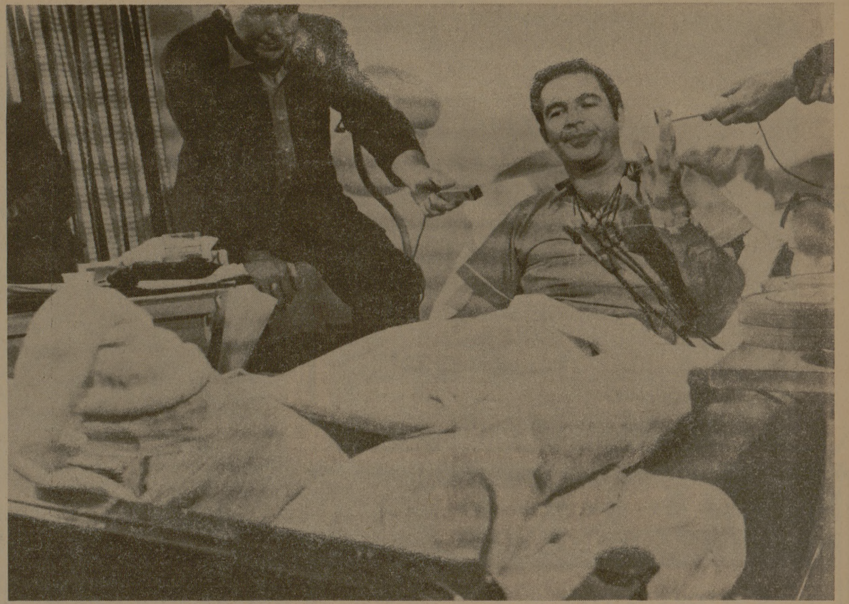
GREEN BAY PACKER coach Dan Devine speaks with reporters at a news conference in his room at a Green Bay hospital. Devine suffered broken bones in his left leg Sunday when he was hit by players during a game between the Packers and the New York Giants.

"In the environmental area in most cases, we would do well to act only after we understand the economic impact, costs and alternatives of a proposed action . . ."