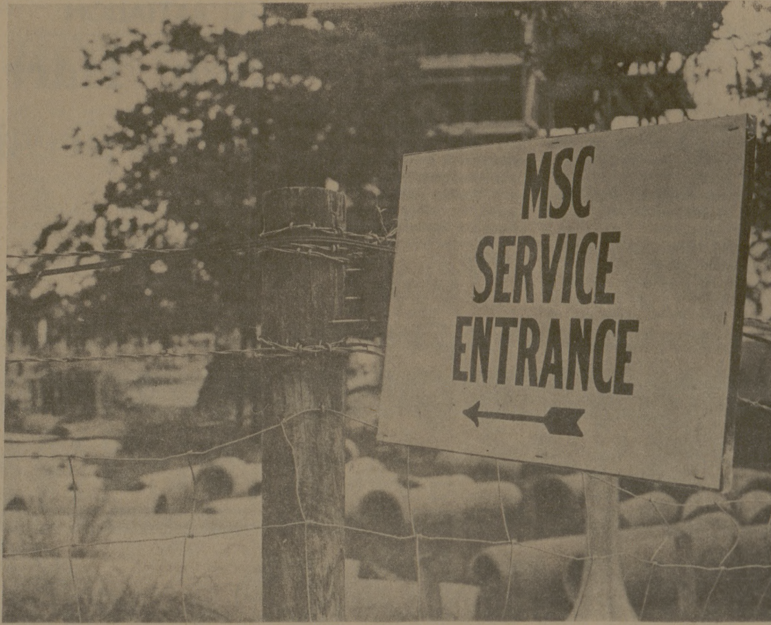
IT MAY BE the service entrance to the Memorial Student Center, but it looks more like a field of concrete pipe. It just goes to show that even the signs get a bit mixed up because there is so much construction going on on campus.