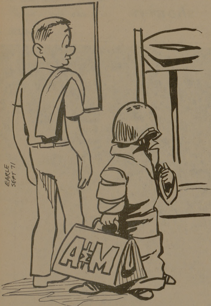
"It's not th' trip to Baton Rouge I'm worried about; it's having to pick up my date in El Paso!"