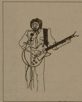
863 Working Class Hero