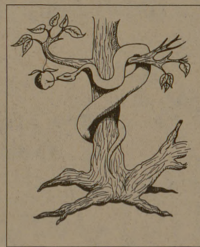
111 The Bite