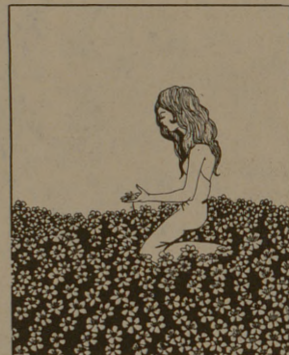
123 Field Flowers