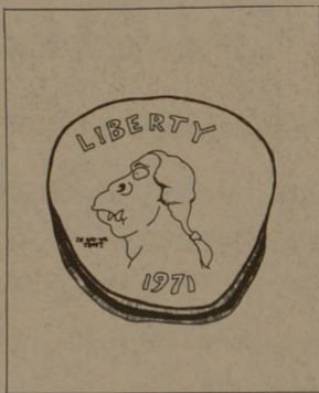
176 Father of Our Country Immortalized in Coin