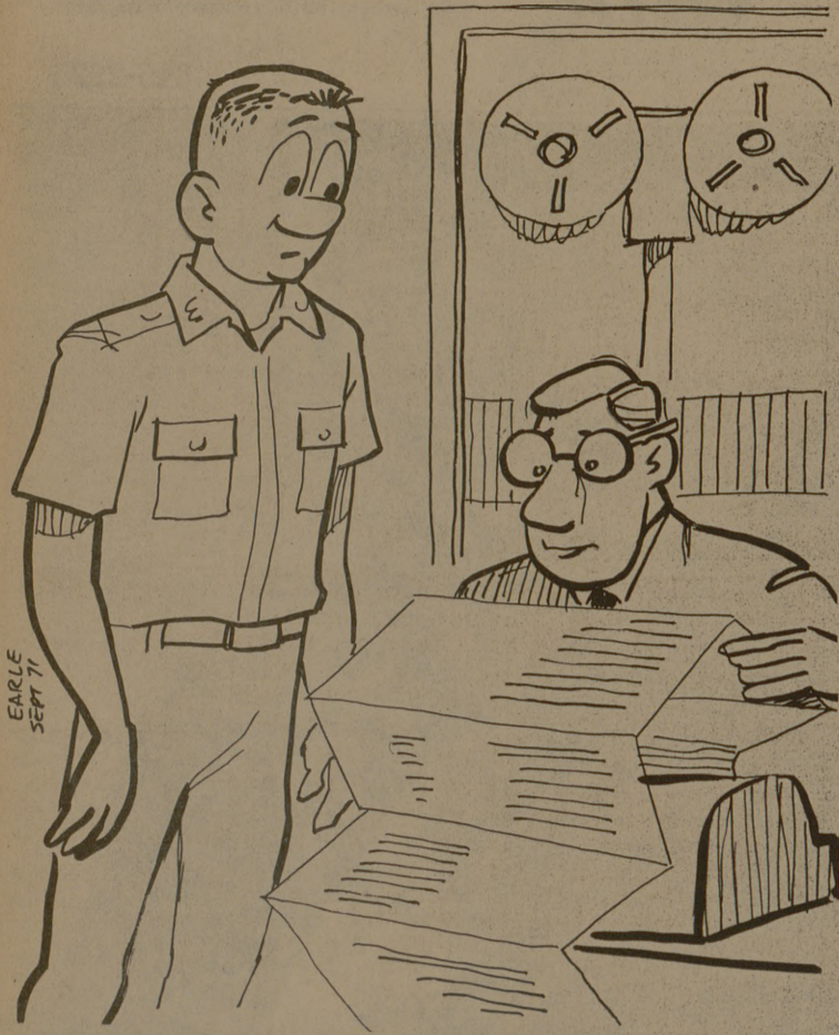
"That's odd! It says 'Aggies 28, Wichita 3, and Hurricane Fern 42!'"