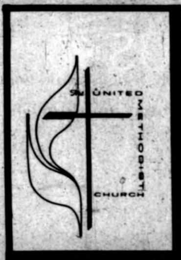
THE CROSS AND FLAME METHODIST SYMBOL