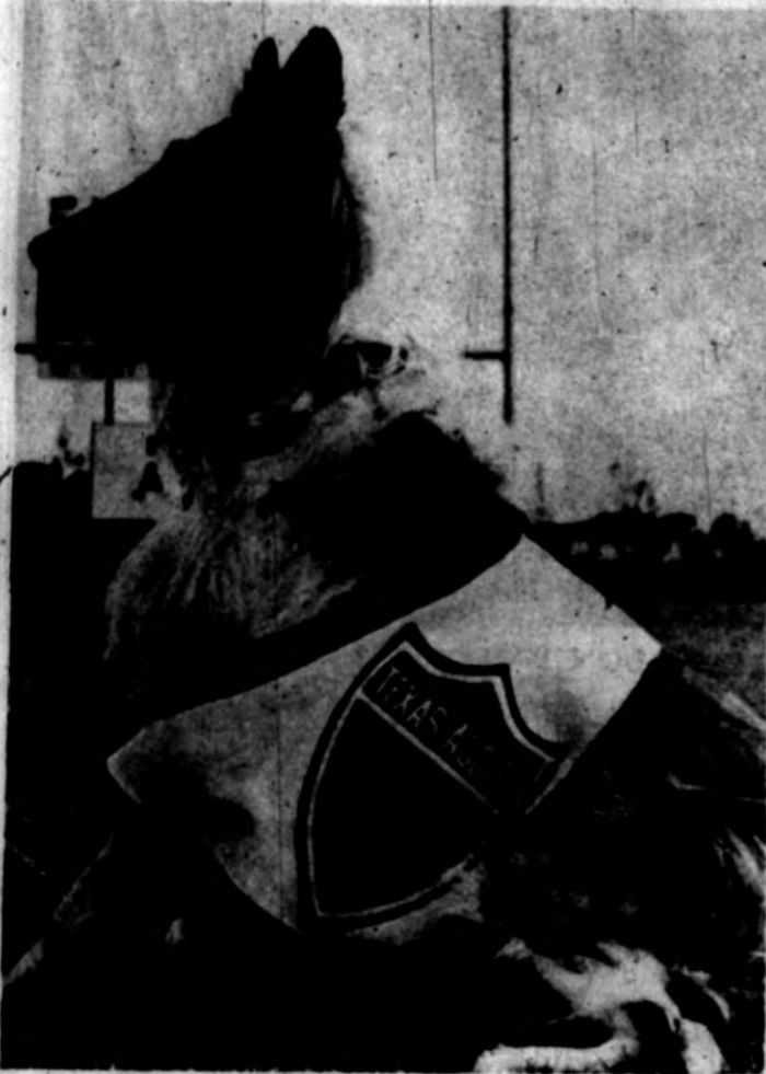
REVELLE III is the official mascot of Aggieland. She's kept and cared for by Company E-2, known as Rebel E. She leads the Fightin' Texas Aggie Band in Kyle Field at home football games and frequently travels to other contests. Her predecessors are buried at the north end of Kyle Field.

The Singing Cadets also traveled to the White House last spring to perform at one of President Richard Nixon's Sunday services. The trip was made possible through an invitation secured with Texas Sen. John Tower's help.