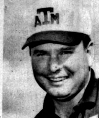
John Paul Young