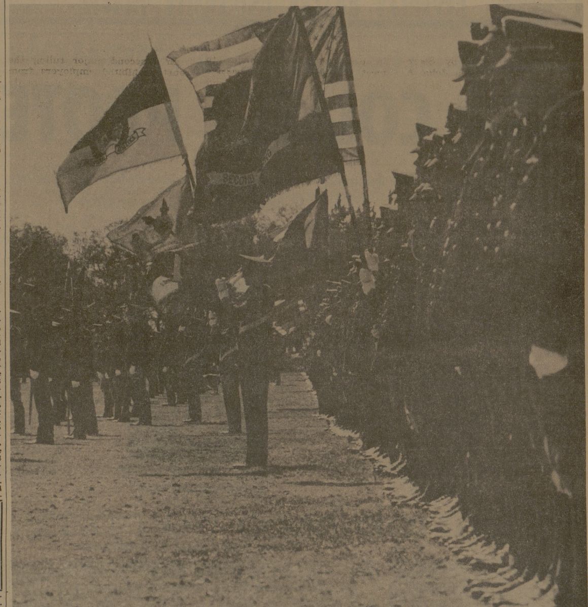
A row of boots

SOSOLIK'S TV & RADIO SERVICE Zenith - Color & B&W - TV All Makes B&W TV Repairs 713 S. MAIN 822-2133