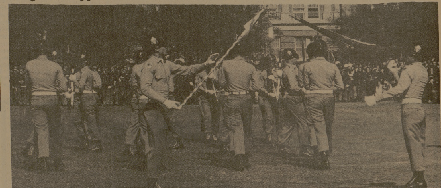
The Fish Drill Team