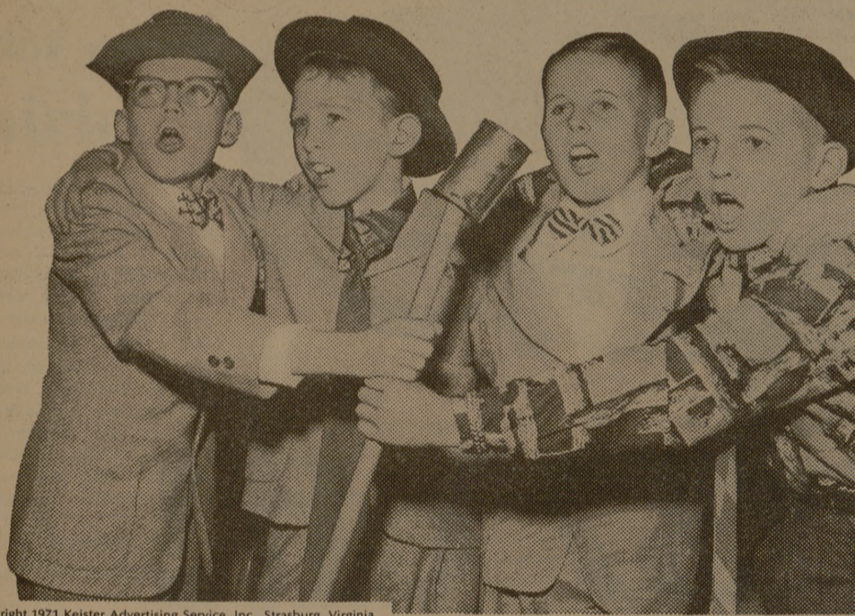
Copyright 1971 Keister Advertising Service, Inc., Strasburg, Virginia. Scriptures selected by the American Bible Society

The truth of the matter is that most of American youth belongs to the finest generation our country has yet raised. While you and I are reading and hearing about the "wild" minority, our churches are working quietly and effectively to mold the faith and character of tomorrow's citizens.