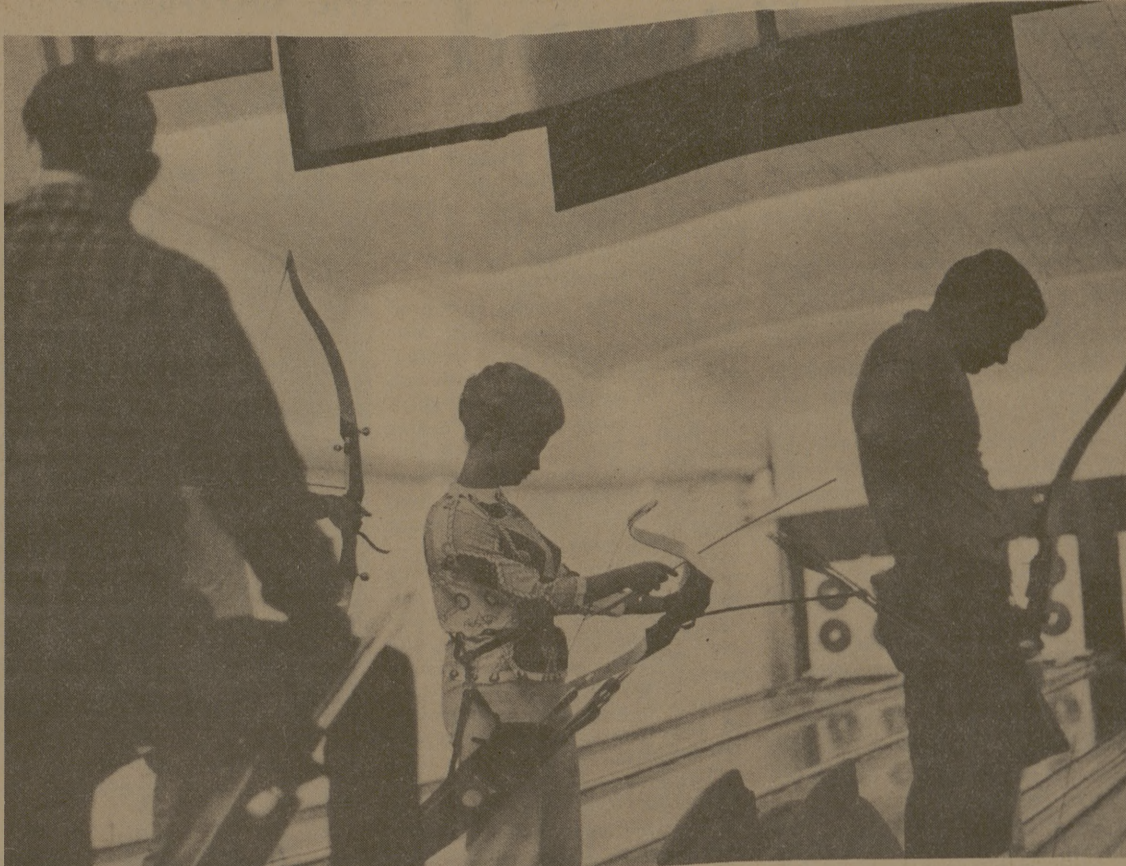
ARCHERS CONTEMPLATE target technique Wednesday night at the Memorial Student Center bowling alley. The Brazos Bowmen adapt ancient weapons to a contemporary setting.

ADMISSION: Rotary Series Ticket Holders: Reserved Sections—Rows 1 - 15 Main Floor Rows 1 - 15 West Balcony (Sec. 104-107) Town Hall Season Ticket Holder and A&M Activity Card Holders: FREE GENERAL ADMISSION OTHER PRICES: Reserved Seats: A&M Student and/or date ..... $2.25 or $2.50 All Others ..... $4.50 or $5.00 General Admission: A&M Student & Date ..... $2.00 Other Students ..... $2.50 All Others ..... $3.50 Tickets, information MSC Student Programs Office Call 845-4671