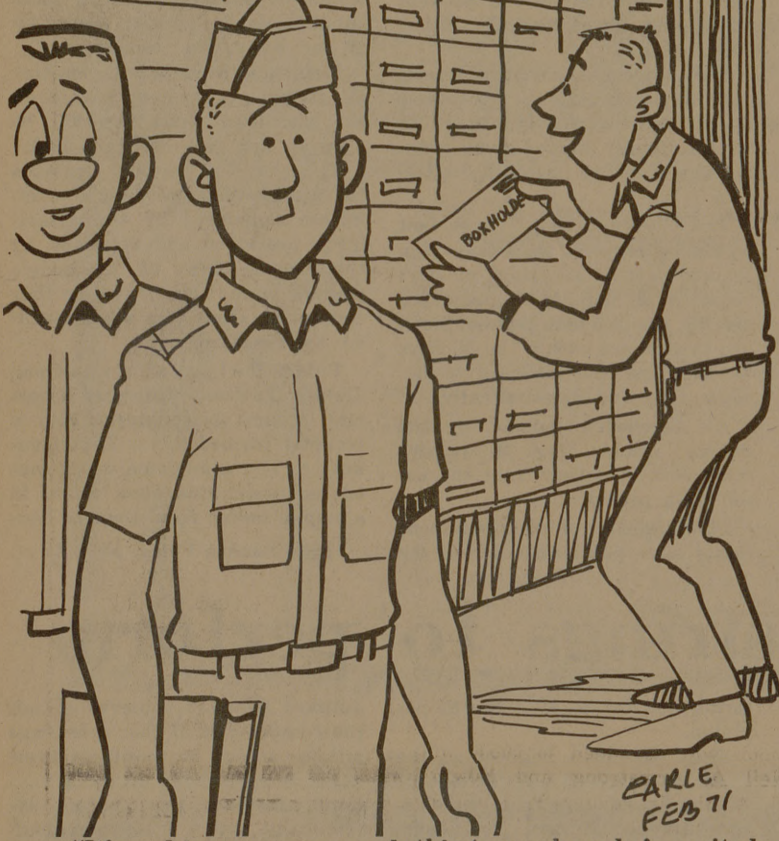
"It's sad to see a guy reach th' stage where he's excited to get a mimeographed notice from his Sunday School class!"