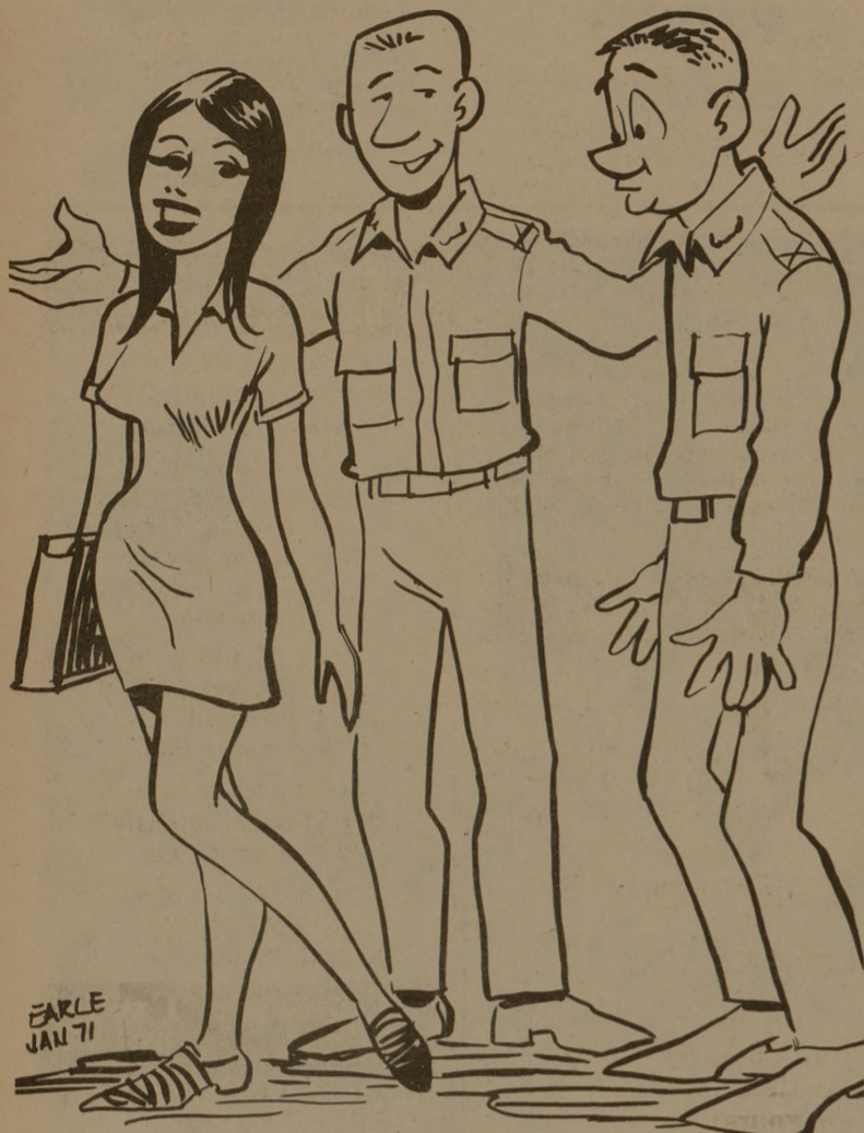
"Remember that blind date with a wonderful personality?"