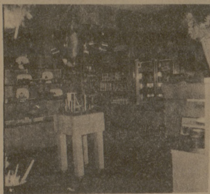
GIFTS & GOURMET SHOP