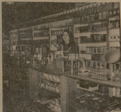
MEN'S GIFTS & ELECTRONICS