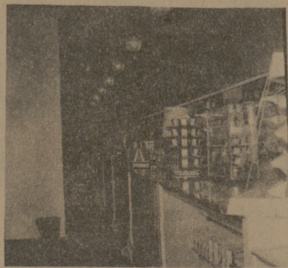
WOMEN'S COSMETIC & JEWELRY