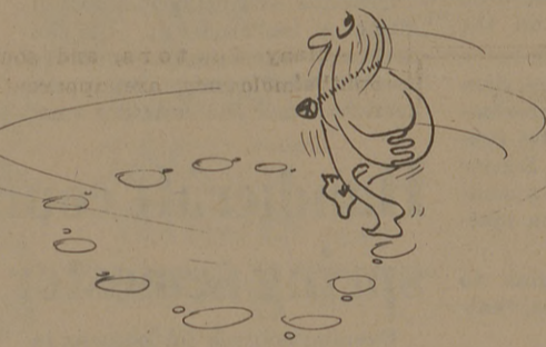
THE PEACE DANCE