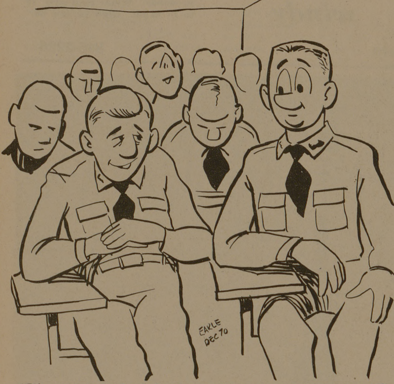
"It's good to be back in class, where we can get our rest!"