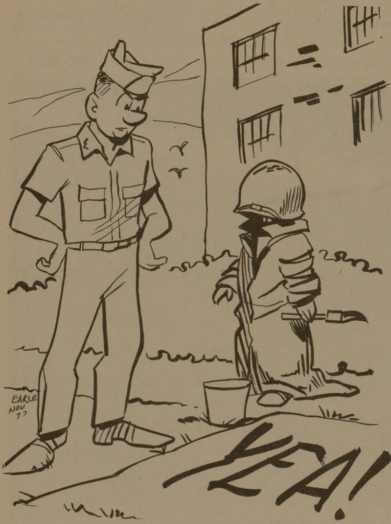
"That's the most noncommittal football sign I've ever seen!"