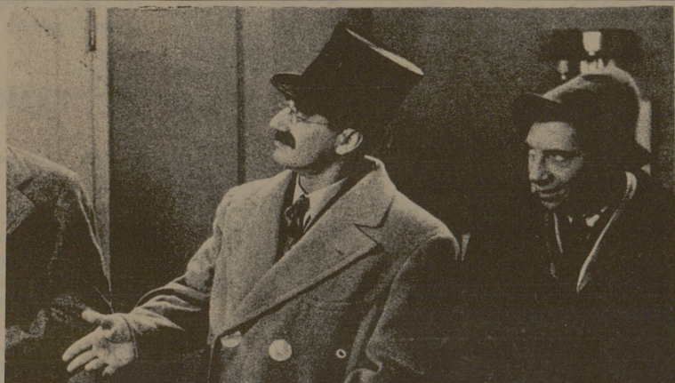
TONIGHT—8 P.M.—MSC BALLROOM