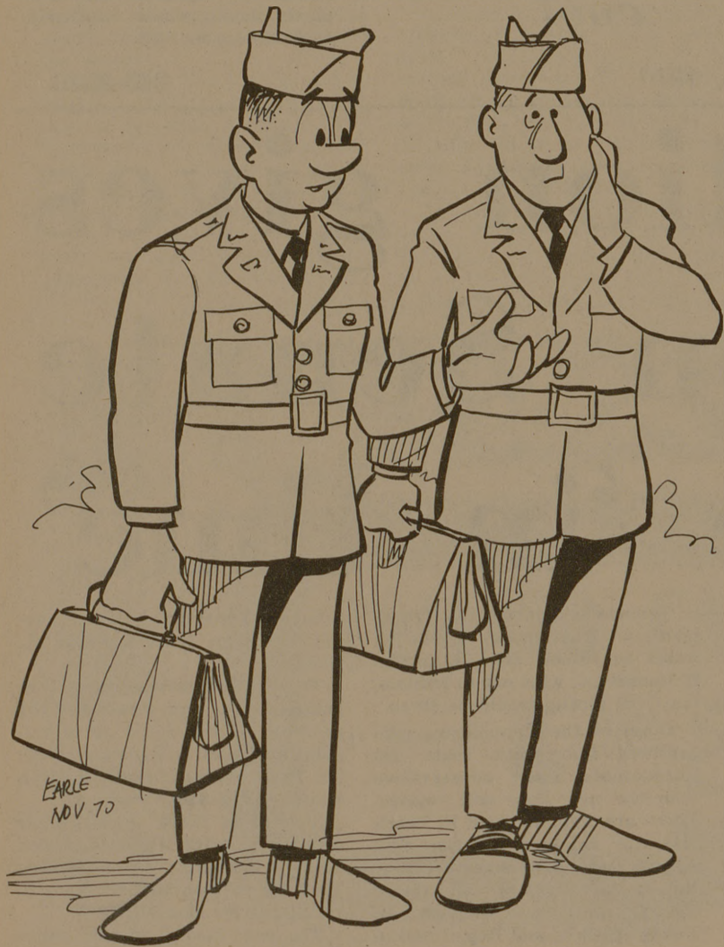
"When I told my instructors my ride was leavin' early, I thought you had a car—didn't you know that I don't have a car either?"