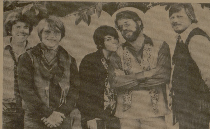
KENNY ROGERS and the FIRST EDITION

Friday Night, November 13, 1970 — 8:00 p. m.