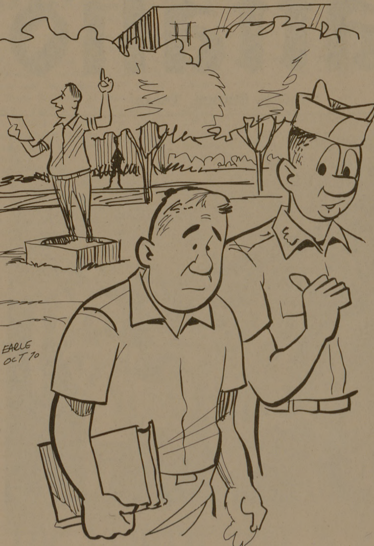
"I can see right now, if this soapbox forum is going to make it everybody will have to bring his own soapbox!"