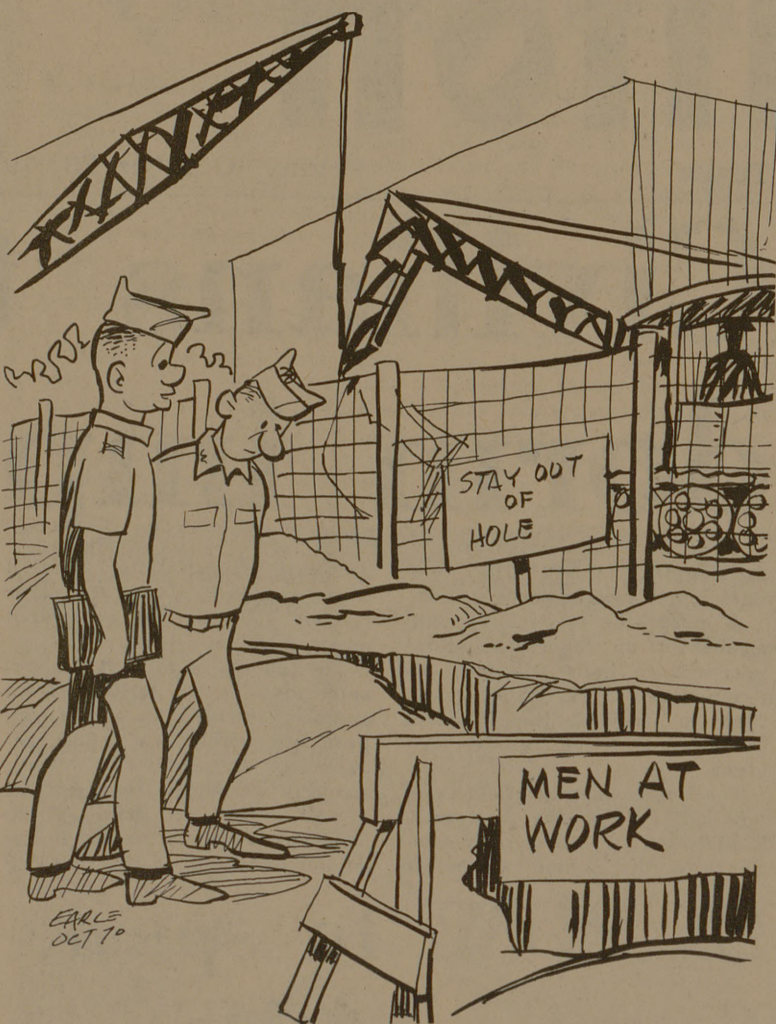
"Have you ever thought of how much would have been saved on holes if th' campus had been built six feet off th' ground?"