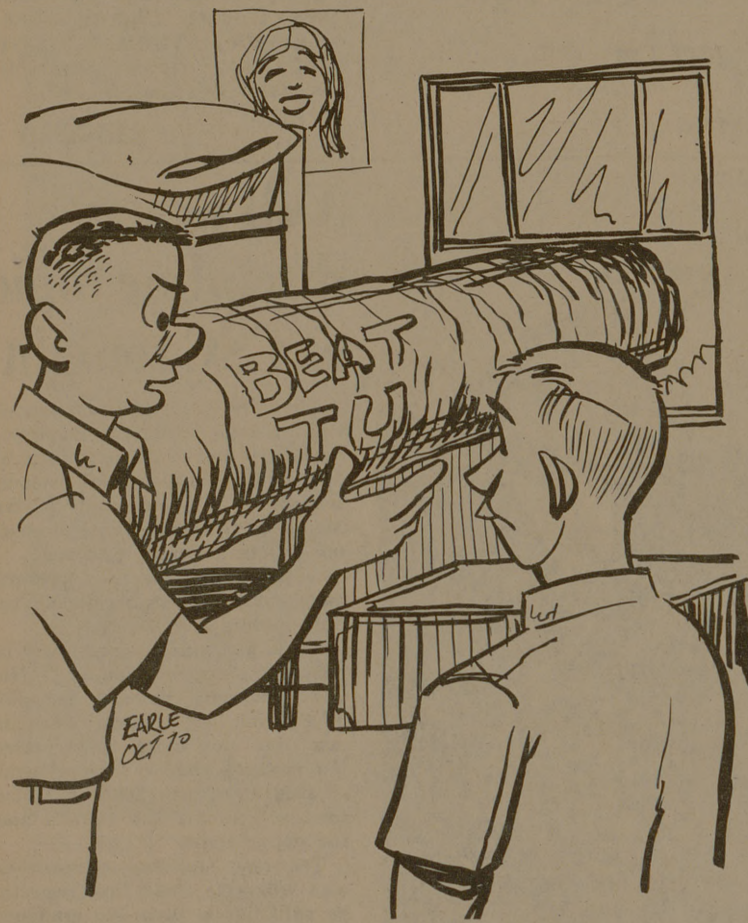
"Yeah, but is it such good bull to have the outfit's first Bonfire log in your room?"