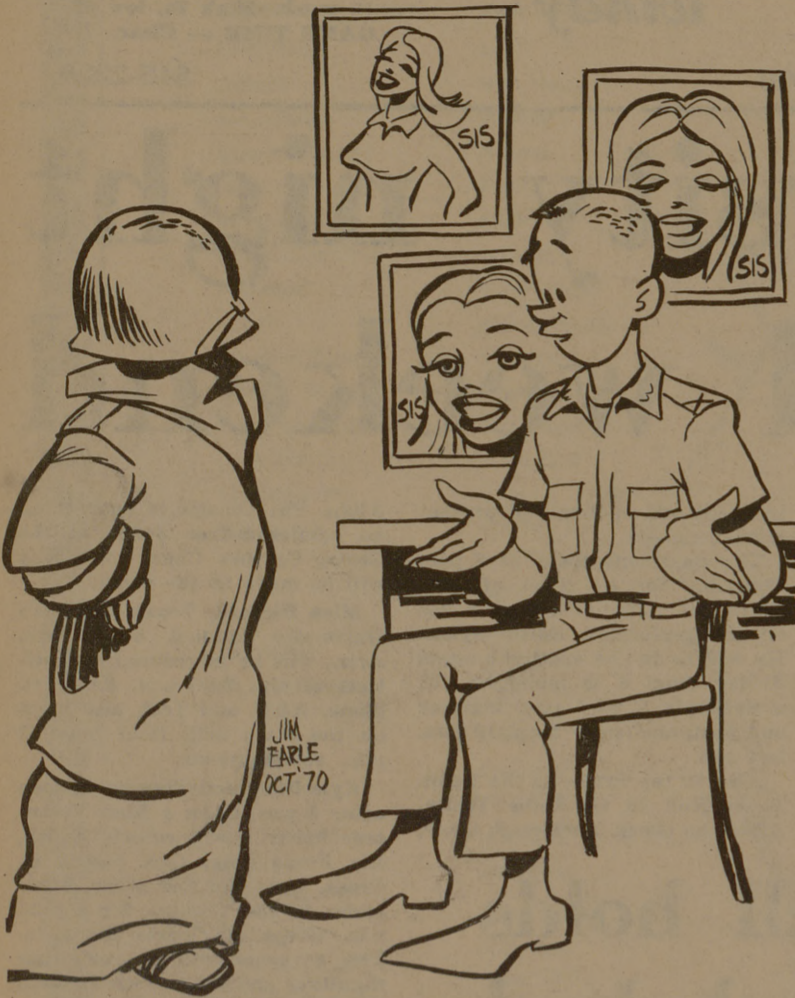
"I can't understand why th' upperclassmen show me such favoritism!"