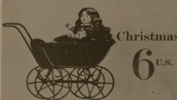
Christmas 6 U.S.