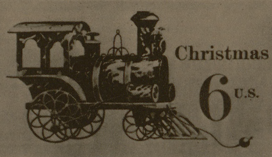
Christmas 6 U.S.

THESE ARE THE DESIGNS of four Christmas stamps which will be printed on the same sheet. They feature four antique Christmas toys — a horse, a mechanical tricycle, a doll carriage and a tin and cast iron locomotive. A fifth stamp featuring a Nativity scene also will be issued.