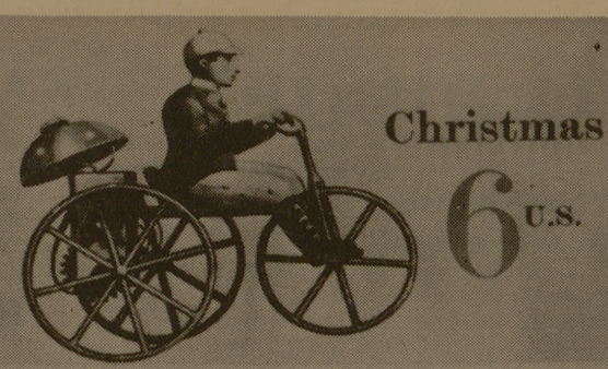
Christmas 6 U.S.