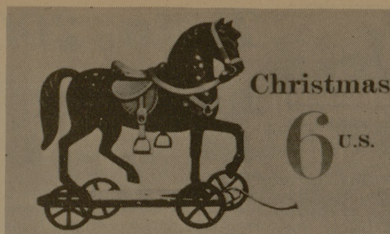
Christmas 6 U.S.

Aside from the maritime academy, majority of the activities planned for the Mitchell Campus centers around the university's Oceanography Department and Sea Grant Program.