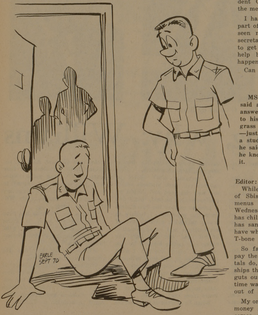
"Those guys are not in th' mood to talk football!"