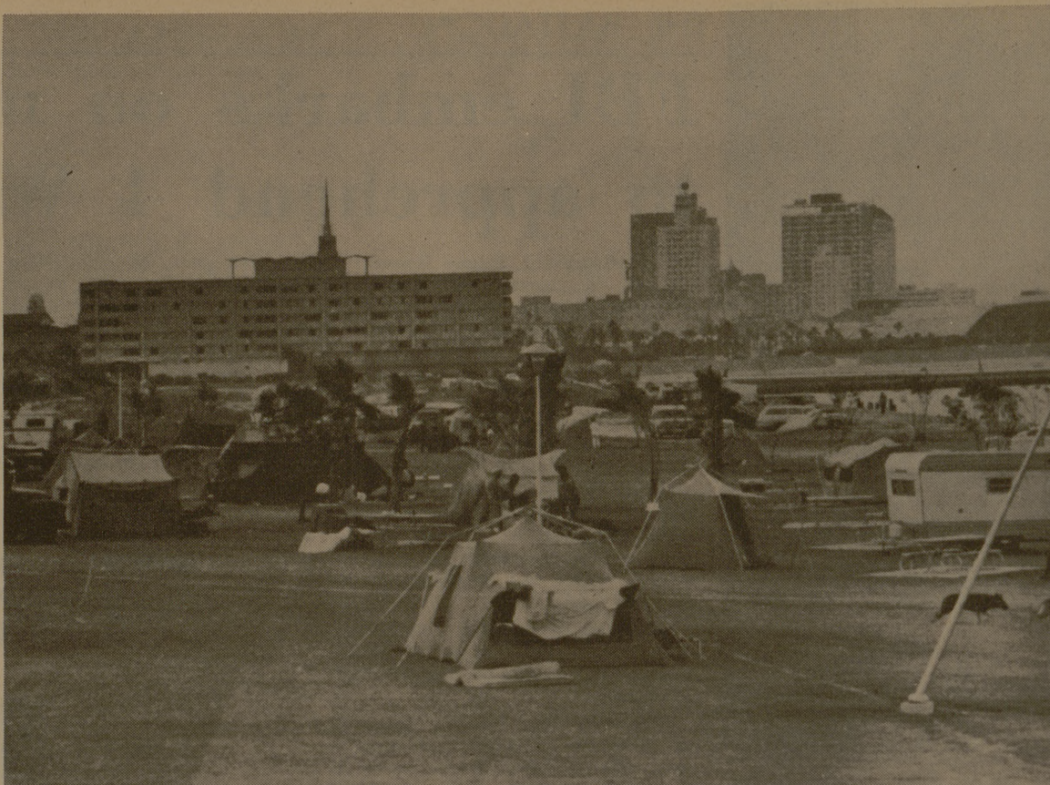
CONSTRUCTION WORKERS from all over the country flocked to Corpus Christi to help rebuild the city after Hurricane Celia wrought great damage. Here a typical tent city for the workers is set up in a bayfront park with the city skyline in the background.

He was on the dean's list his first and fifth years of the five-