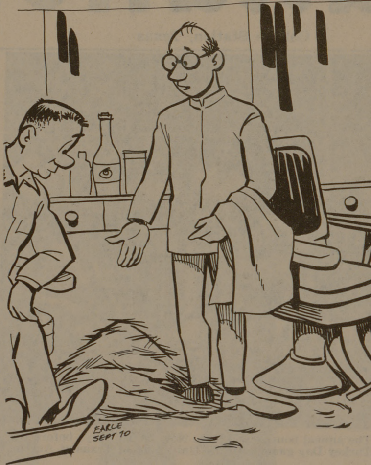
"Can you believe it? Off of one man, too!"

San Antonio draws sewage reprimand The City of San Antonio drew a sharp reprimand from the Texas Water Quality Board for dumping 12 million gallons of raw sewage into the San Antonio River on Aug. 3 (in anticipation of a heavy rain). Board sent the matter to the attorney general to determine if a penalty suit should be filed and handed down an order threatening an injunction if the violation ever happens again. Dissatisfied with the city's lack of an emergency corrective plan, Board directed its own staff to come up with something to give San Antonians in certain areas relief from overcrowded sewage facilities pending passage of a bond issue for vast new lines.